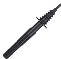
Pin probe 11 kV (ba- nana socket) black