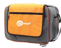
L4 carrying case