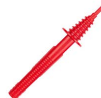
Pin probe 11 kV (banana socket) red