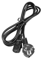
Mains power cable Uni-Schuko / IEC C13 plug