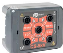
CS-5kV cali- bration box

WAPRZ003REBB10K WAPRZ005REBB10K WAPRZ010REBB10K WAPRZ020REBB10K